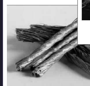
بولي تويست فايبر POLYTWIST FIBER