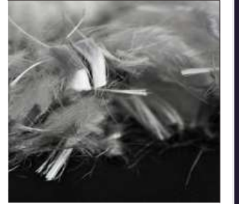
بولي بروپيلين فايبر POLYPROPYLENE FIBER