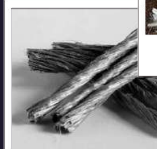
بولي تويست فايبر @EESF POLYTWIST FIBER