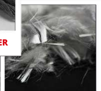
بولي بروبيلين فايبر @EESF POLYPROPYLENE FIBER