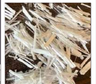
جلاس فايبر @EESF Glass Fiber