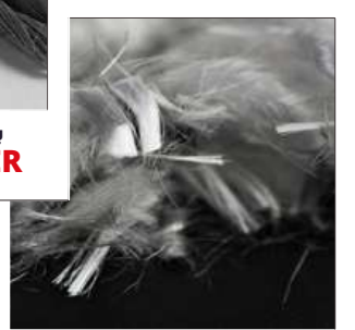
EESF® بولي بروبيلين فايبر POLYPROPYLENE FIBER