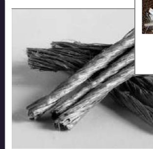
EESF® بولي تويست فايبر POLYTWIST FIBER