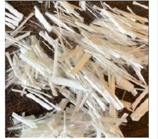
EESF® جلاسي فايبر Glass Fiber